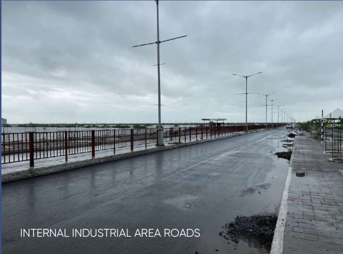
INTERNAL INDUSTRIAL AREA ROADS