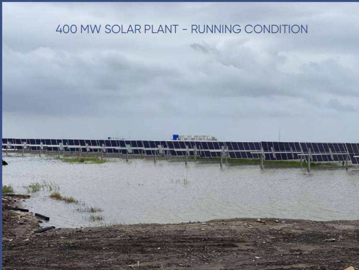
400 MW SOLAR PLANT - RUNNING CONDITION