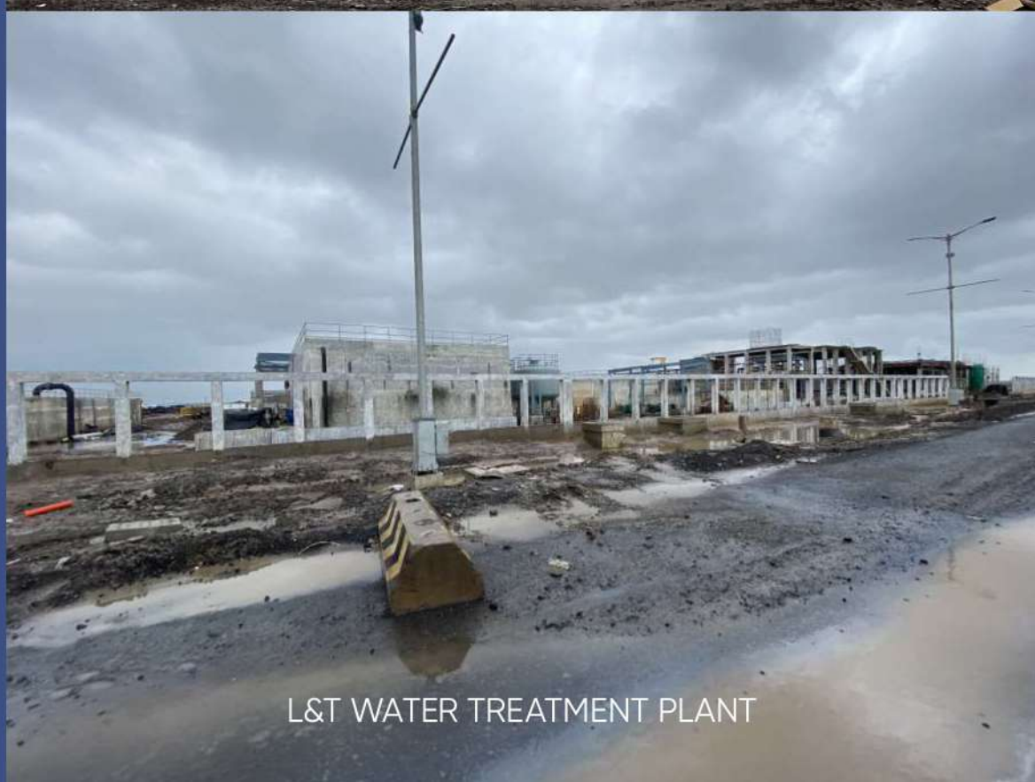
L&T WATER TREATMENT PLANT